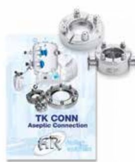
TANK AND IN-LINE CONNECTIONS