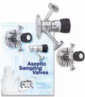
ASEPTIC SAMPLING VALVES