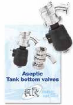
ASEPTIC TANK BOTTOM VALVES