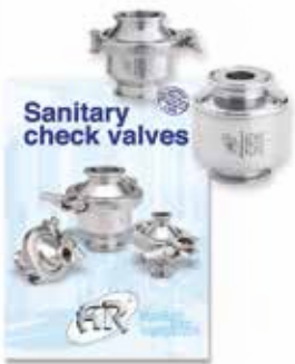
SPRING CHECK VALVES