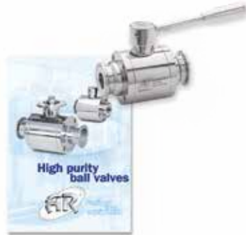
HIGH PURITY BALL VALVES