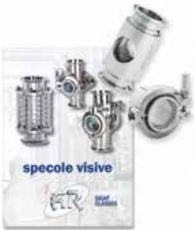
SIGHT GLASS-FLOW INDICATOR