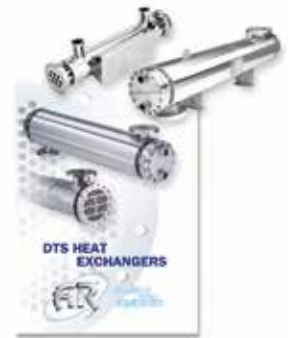
DTS HEAT EXCHANGERS