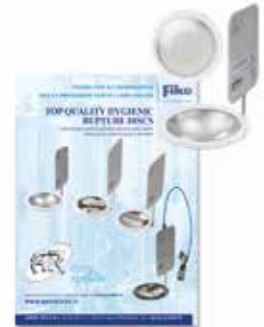
HYGIENIC RUPTURE DISC