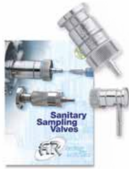
SANITARY SAMPLING VALVES