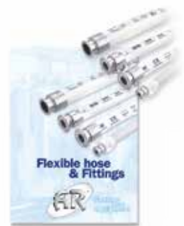
FLEXIBLE HOSES & FITTINGS