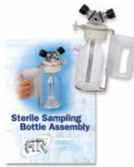
ASEPTIC SAMPLING BOTTLE