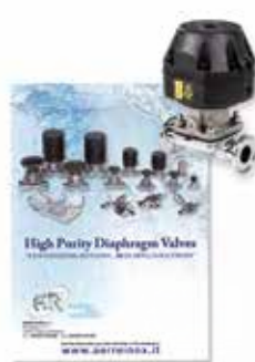
HIGH PURITY DIAPHRAGM VALVES