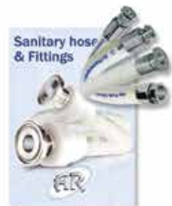
SILICONE HOSE & FITTINGS