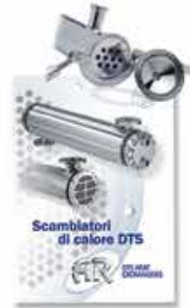
DTS HEAT EXCHANGERS