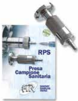
SANITARY SAMPLING VALVES