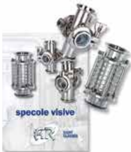
SIGH GLASS-FLOW INDICATOR