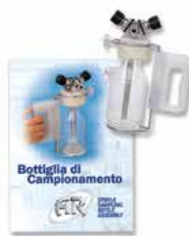
SANITARY SAMPLING BOTTLE