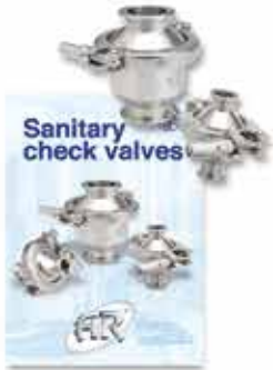
SPRING CHECK VALVES