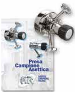
ASEPTIC SAMPLING VALVES