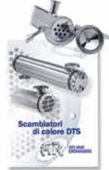
DTS HEAT EXCHANGERS