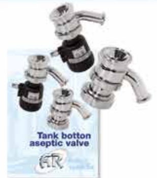
TANK BOTTOM ASEPTIC VALVE