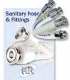
SILICONE HOSE & FITTINGS