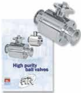
HIGH PURITY BALL VALVES